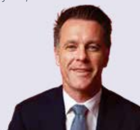
Chris Minns MP Premier of NSW

Find me on Facebook, Instagram and Twitter.