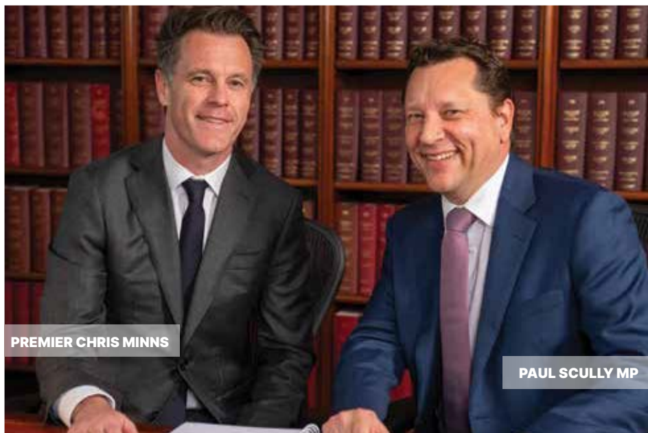
PREMIER CHRIS MINNS