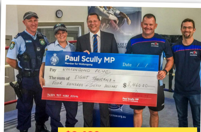
$8,460 for Wollongong's PCYC

I encourage volunteer, not-for-profit community groups based in the Wollongong electorate to start thinking about possible projects to apply for. Feel free to contact me on 4226 5700 for more information.