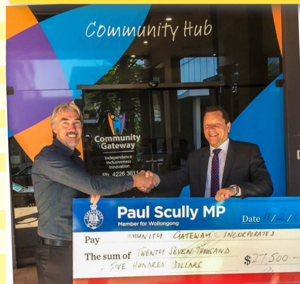
$27,500 for Community Gateway Wollongong Hub