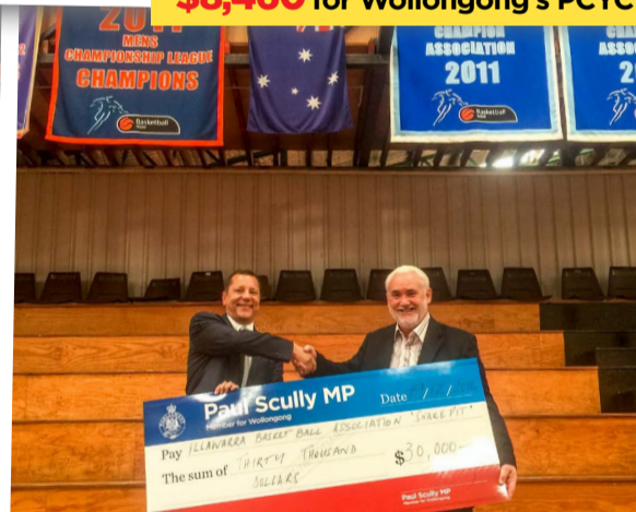
$30,000 for Illawarra Basketball Assoc. Ltd