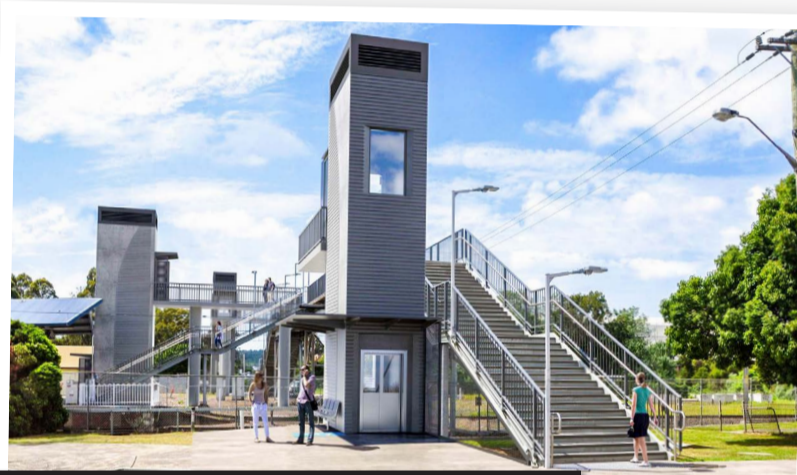
ARTIST'S IMPRESSION OF UNANDERRA STATION