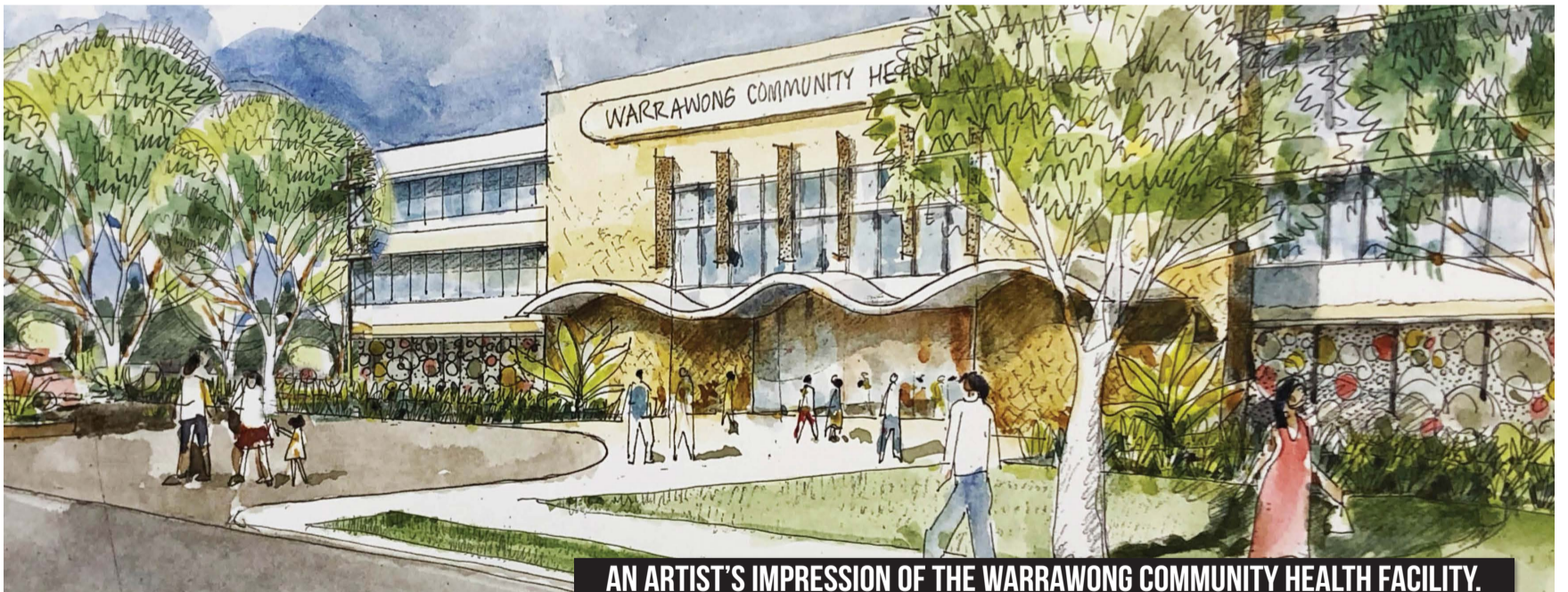
AN ARTIST'S IMPRESSION OF THE WARRAWONG COMMUNITY HEALTH FACILITY.

A key priority for 2022 must be the finalisation of plans and new location of the new Warrawong Community Health facility.