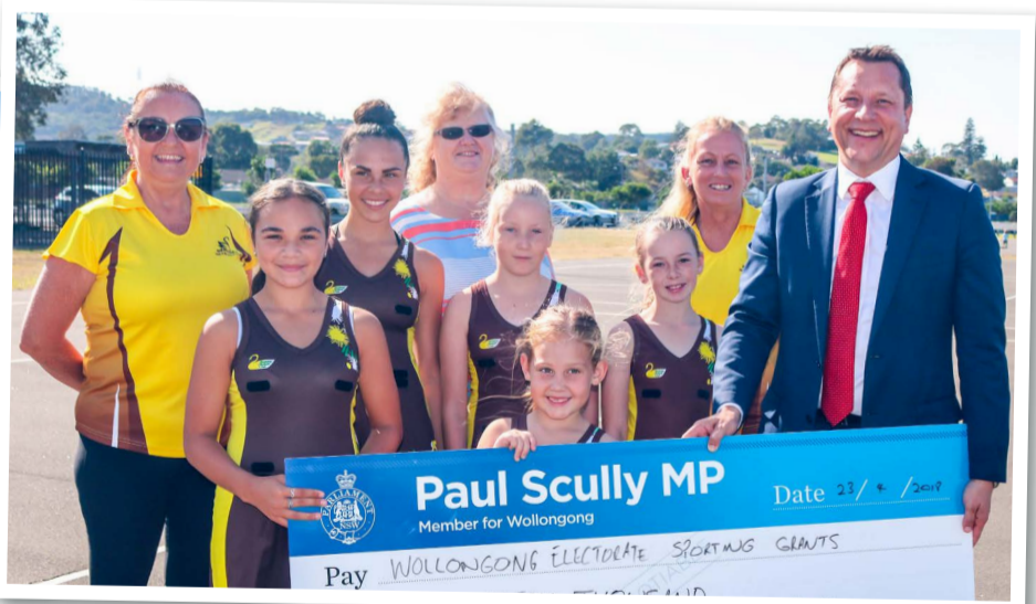
THESE PHOTOS WERE TAKEN BEFORE SOCIAL DISTANCING WAS INTRODUCED.

Tennis, netball, swimming, cycling, football, baseball, rugby league and surf lifesaving clubs round out the recipients of the sporting grants aimed at improving infrastructure and purchasing new equipment to help attract and retain players.