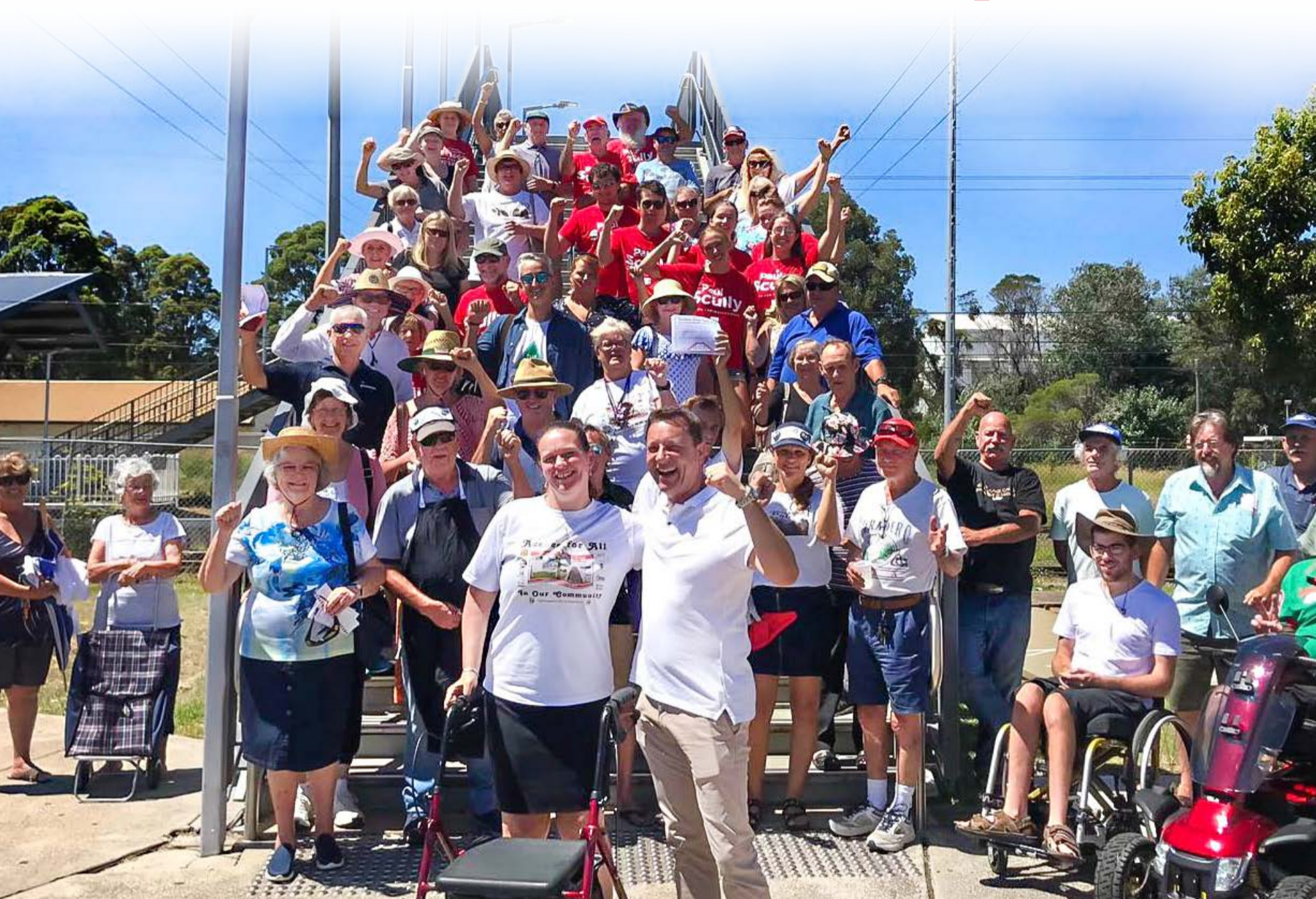
THIS PHOTO WAS TAKEN BEFORE SOCIAL DISTANCING WAS INTRODUCED.

Transport for NSW has reported on the community consultations following the release of the concept design to upgrade Unanderra Station, including building its much-needed lifts.